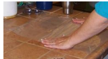
Spread Plastic wrap on counter