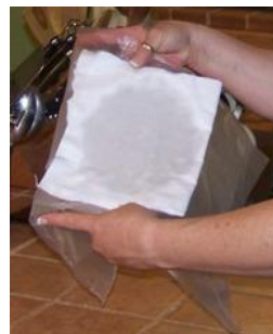
Pick up entire Pack