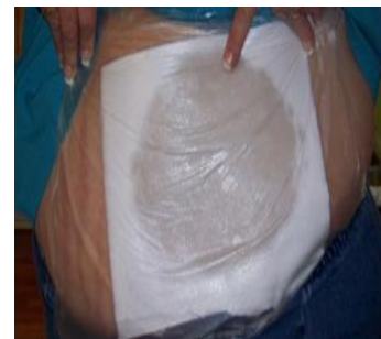
Apply on right side over Liver.

Cover with towel and heating pad. Turn off heating pad before falling asleep. Leave pack on the entire night.