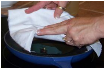
Place in warm oil