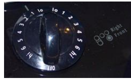
Set heat to Low