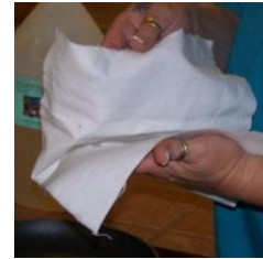
Fold Flannel Once