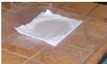
Place warm pack in center of wrap