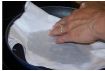
Soak up oil